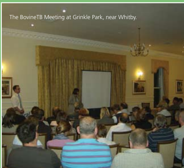
The BovineTB Meeting at Grinkle Park, near Whitby.

www.lantra.co.uk/Downloads/Projects/LandSkills-YH/LandSkills-YH-providers